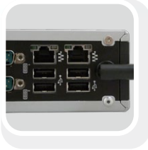
Dual LAN (Option)