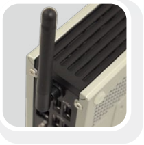
Wireless support (Option)