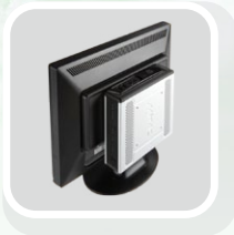
VESA mount support