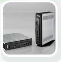
Vertical and horizontal orientation